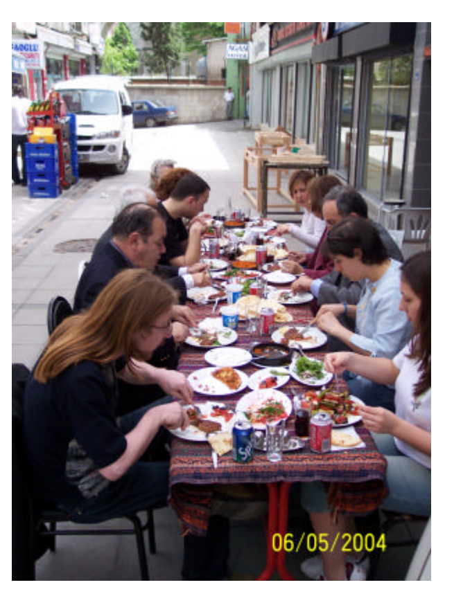
You have to feed well before the Congress...