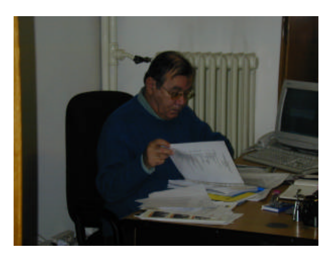
"I am too busy..."