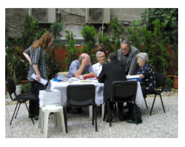
Even the Council does not know what to do...