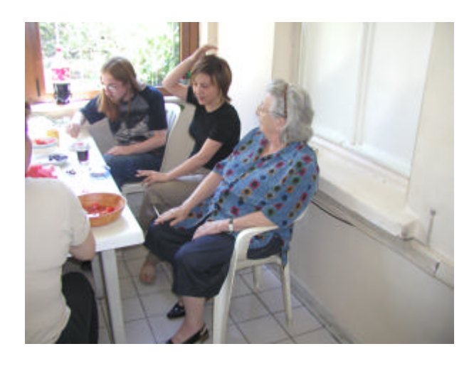
Nothing like relaxing...