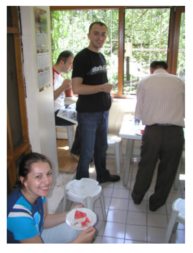
Watermelons give energy...