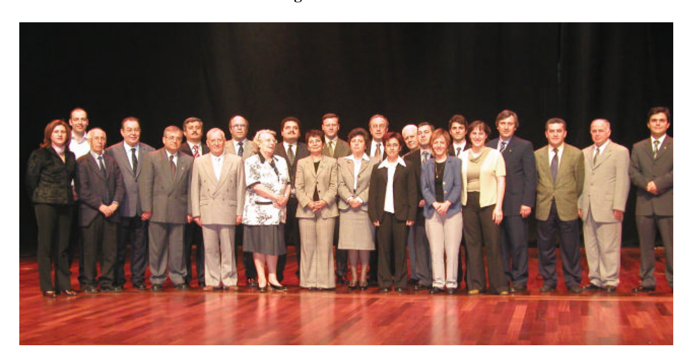
and to the Magister Tours, Inc.